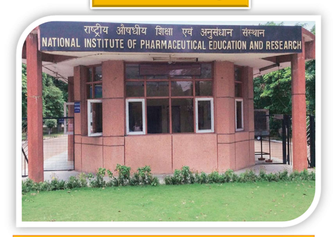
Ph.D. programmes offered by NIPER-SAS Nagar for the academic year 2021-22